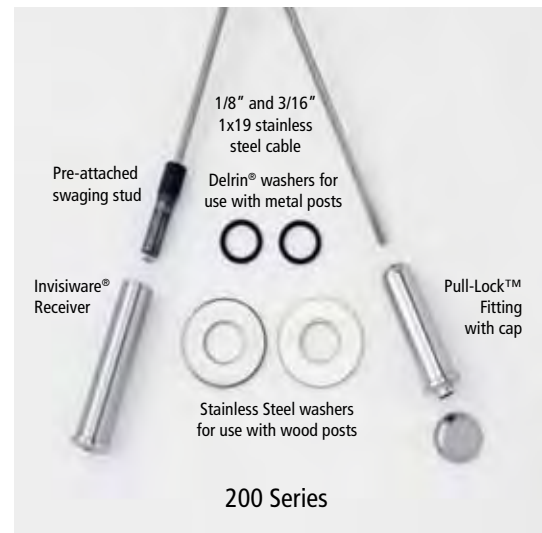
Railing Kits for Deck 1

The tensioning device is a 2" - (or 1½"-) long Invisiware Receiver, which installs flush through the metal post on one end. A Pull-Lock fitting is installed through the other end.